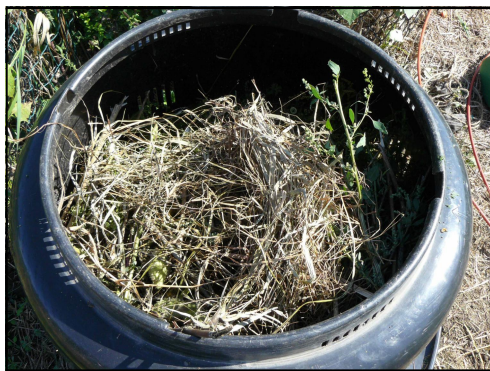
Add hay for brown layer

Add the green and brown items to your compost bin in layers. For example, when you add kitchen scraps to your bin, throw on a layer of brown such as leaves or hay. In fact, this is the best way to deter critters. Make sure you water your compost bin until a handful of it feels like a sponge that's been wrung out. Never add meat products, oil, bread products, dairy products or manure of any type to your bin. You can turn your pile with a fork periodically (adds air) to speed up the process, but if you do nothing, it will make compost in about a year. An easy way to 'turn' your compost is to remove the bin from around your pile. This is easy to do if you are using a wire cage that is fastened temporarily with a string. Set the empty cage next to your old pile. Use a pitch fork to transfer the top of the old pile to the bottom of the cage. When you get about half way down, you'll start to find finished compost. Continue adding browns, greens and water to the new pile and harvest compost in about a year.