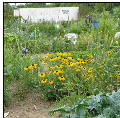
Pictured left to right: